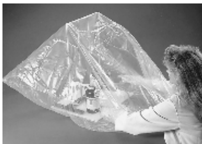
Two-hand AtmosBag shown here with Benchrack lattice system.

The Aldrich AtmosBag is a 0.003-in. gauge PE bag that can be sealed, purged, and inflated with an appropriate inert gas, creating a portable, convenient, and inexpensive "glove box" for handling air- and moisture-sensitive, as well as toxic, materials. Other applications include dust-free operations, controlled-atmosphere habitat, and, for the ethylene oxide-treated AtmosBag, immunological and microbiological studies. Small AtmosBags have one inlet per side. Includes instructions.