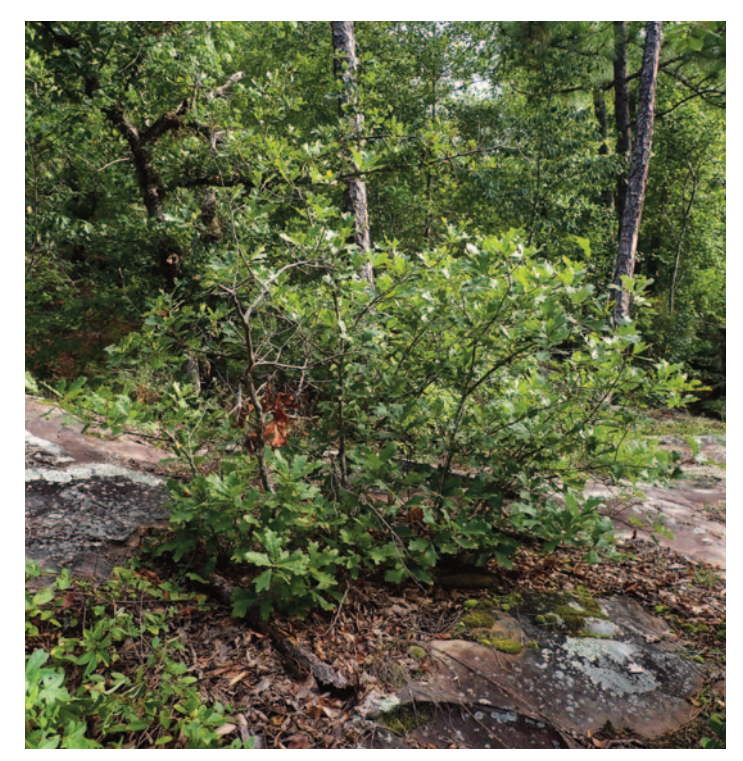
Shrub form Qboy in habitat, Jefferson County AL