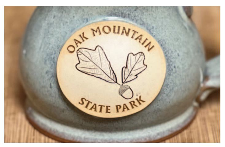
Oak Mountain State Park mug with a graphic of Qboy leaves and an acorn