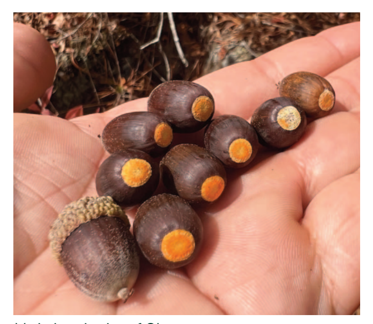
Variations in size of Qboy acorns

Looking ahead, a number of these activities will continue, and new activities that are highlighted in the action tables below will be of focus in the near future. However, further support through collaborations, resources and funding will be critical to the implementation and success of these activities. For more information on how to get involved/support these efforts, please contact the GCCO Coordinator and Species Action Plan Manager.