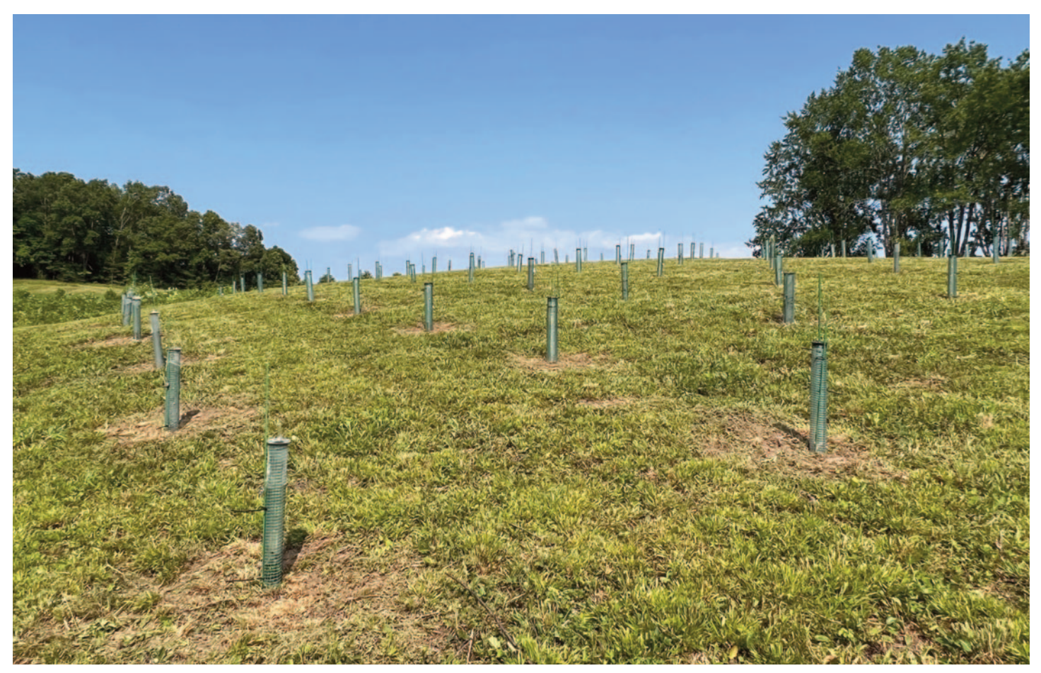
Ex situ conservation grove planting of Qboy at Beech Creek Seed Orchard (USFS)

This is a living document and was started in September/ October of 2021 as a result of the Quercus boyntonii conservation action plan workshop. This plan is following a 10 year timeline but will be reviewed annually through communication via email and meetings. Also annual workshops will be held to assess the overall plan, discuss changes to be made to the plan and update one another on accomplishments, as well as gaps in our efforts. Additional information can be added at any time, given it is reviewed and accepted by all who were a part of the workshops and those who will be conducting activities laid out in the plan. Plans will be published on the Global Conservation Consortia website (including in draft format).