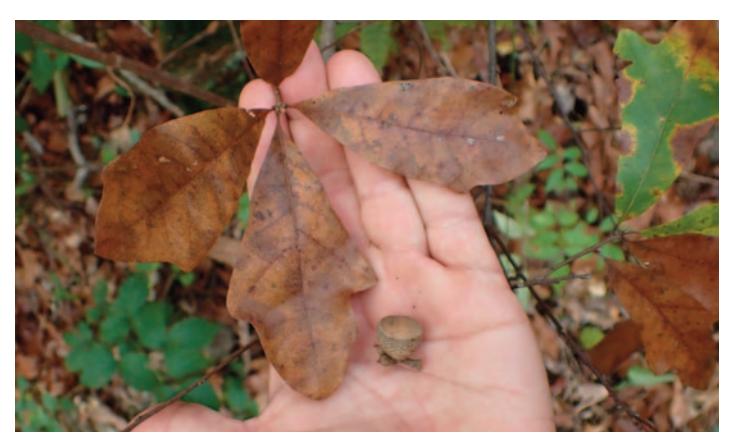
Qboy leaves with reduced lobing and acorn cupule, St Clair County AL