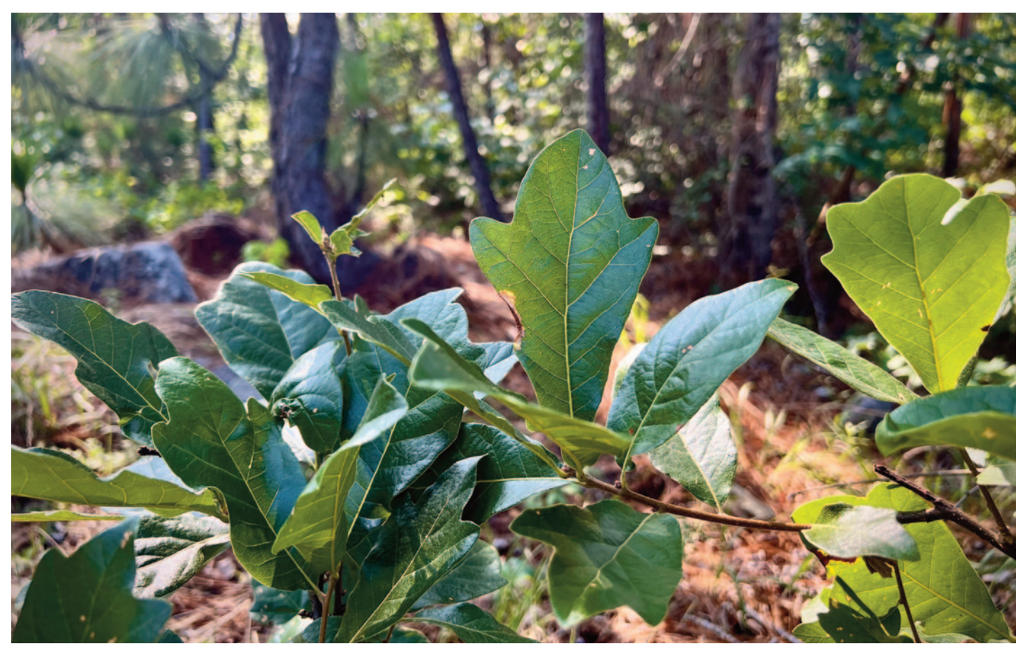
Qboy's consistently dark green glossy leaves, St Clair County AL

Responsible parties: Donald E. Davis Arboretum, Alabama Natural Heritage Program Collaborators: AL SWAP authors