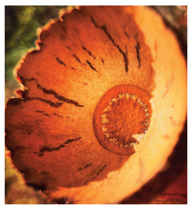
Oak acorn cupule

Given the large, global distribution of oaks and their myriad of threats, the Global Conservation Consortium for Oak (GCCO), which falls under Botanic Gardens Conservation International (BGCI), was launched to coordinate a network of institutions and experts to collaboratively implement comprehensive conservation strategies to prevent extinction of the world's oak species. The GCCO is led by The Morton Arboretum and has successfully established the network in the US, Mexico and Central America, China and Southeast Asia. In the US specifically, the GCCO is focusing on conservation efforts for 30 priority threatened species, 28 of which were assessed in the Conservation Gap Analysis of Native US Oaks (Beckman et al., 2019). The US region for the GCCO is divided into three subregions, based on where the species are distributed geographically. There is the Eastern US, Texas Southwest and the Western US sub-regions, all of which focus on 10, 10, and 10 priority species, respectively.