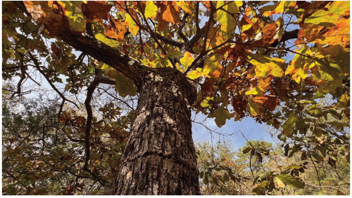
Qboy tree in its habitat St Clair County AL