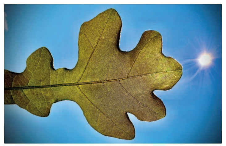
Up-close view of Qboy leaf venation

Responsible parties: Huntsville Botanical Garden, Donald E Davis Arboretum, Oak Mountain State Park Collaborators: Alabama Invasive Plant Council, Alabama Plant Conservation Alliance, Ruffner Mountain Group