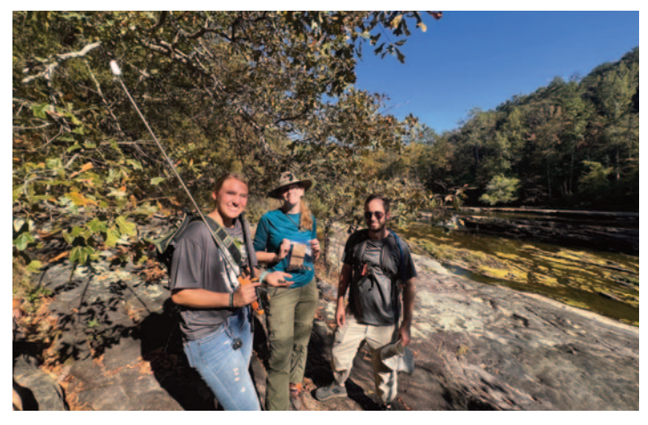
GCCO partners in the field surveying for and collecting Qboy, Blount County AL