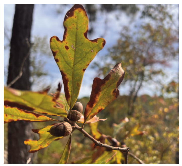
Qboy leaves, Shelby County AL

Responsible parties: The Morton Arboretum, Huntsville Botanical Garden, Donald E. Davis Arboretum Collaborators: DCNR Oak Mountain State Park, USFS Region 8, Stephens Lake Park Arboretum, Chicago Botanic Garden, Atlanta Botanical Garden, Birmingham Botanical Garden, The University of Alabama in Huntsville, Athens State University, The Colonial Williamsburg Foundation, Longleaf Botanical Gardens, US National Arboretum