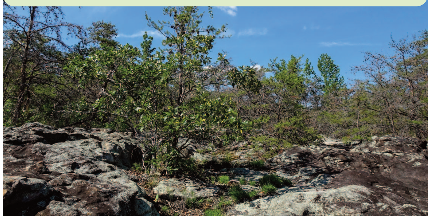
Qboy habitat, Shelby County AL

To understand how to best manage Qboy populations, we encourage per population assessments to identify both the species that represent the biggest threats to Qboy as well as any desired species present among each population to make better recommendations to landowners.