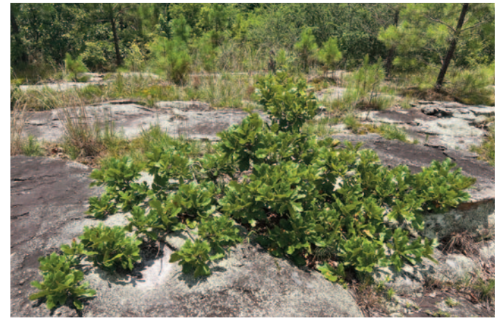
Prostrate form Qboy in habitat, St Clair County AL