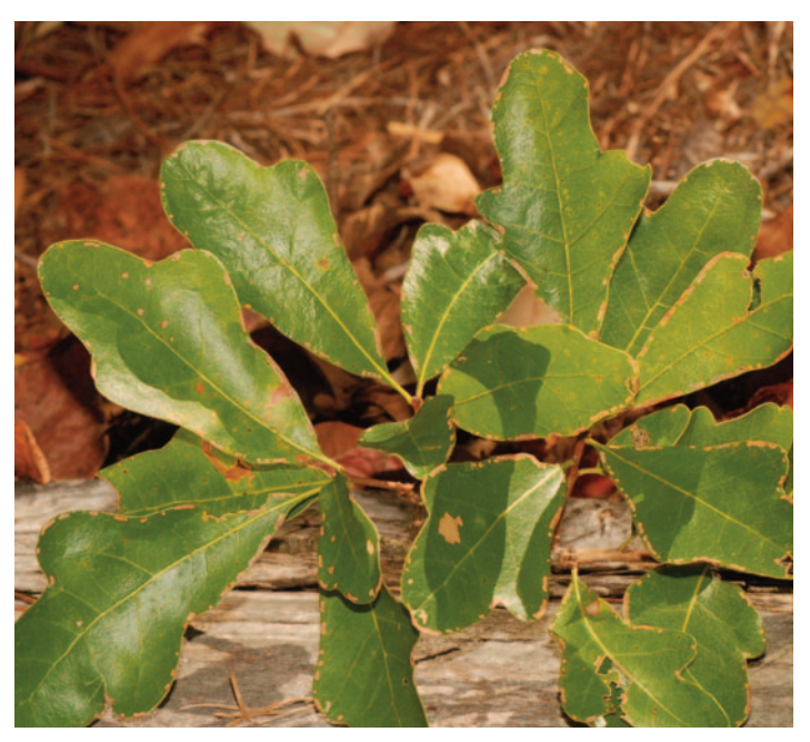
Qboy leaves and acorns, Jefferson County AL