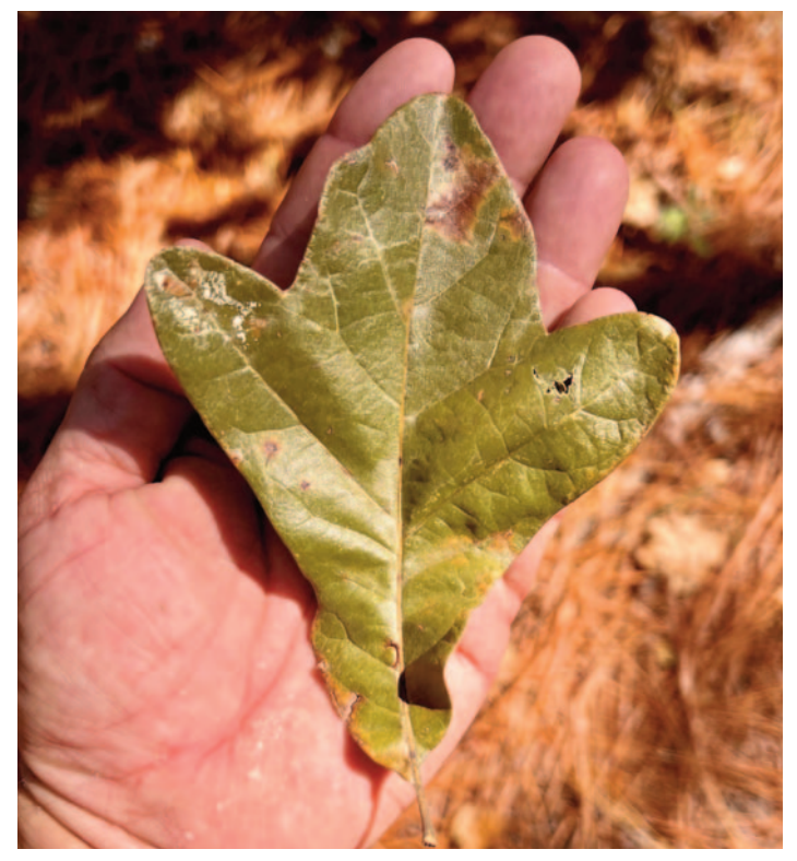
Typical Qboy with 3 lobes in the distal third of the leaf

Ex situ- how are we doing in regards to genetic diversity capture?