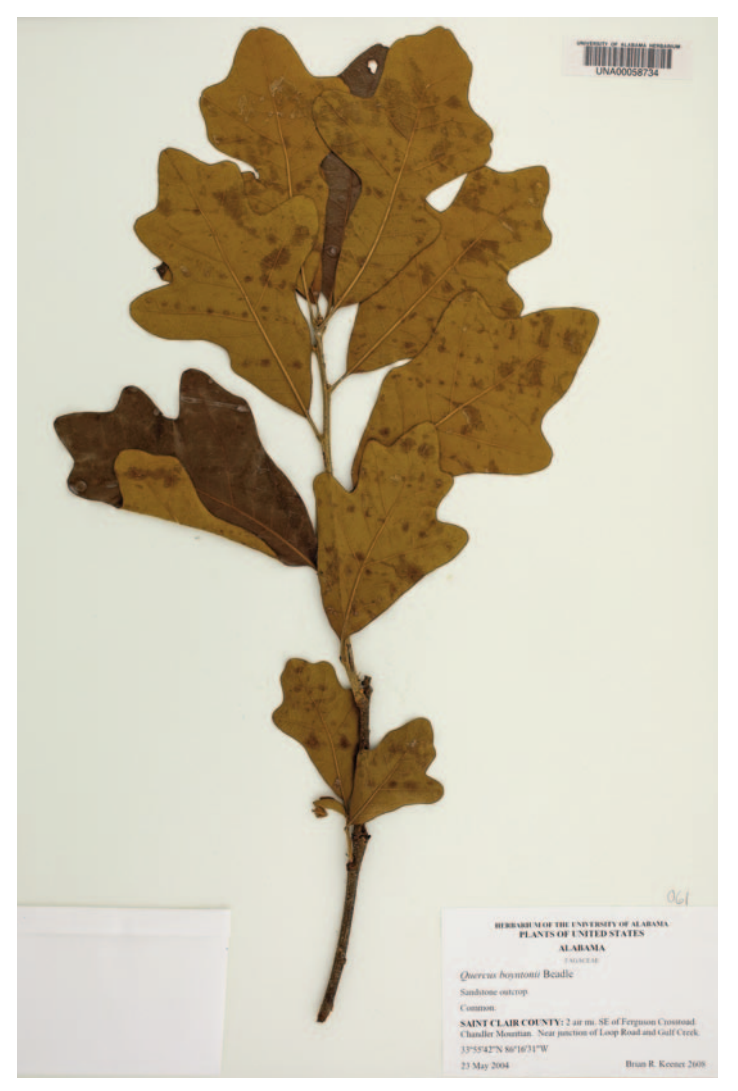
Herbarium voucher of Qboy branch and leaves