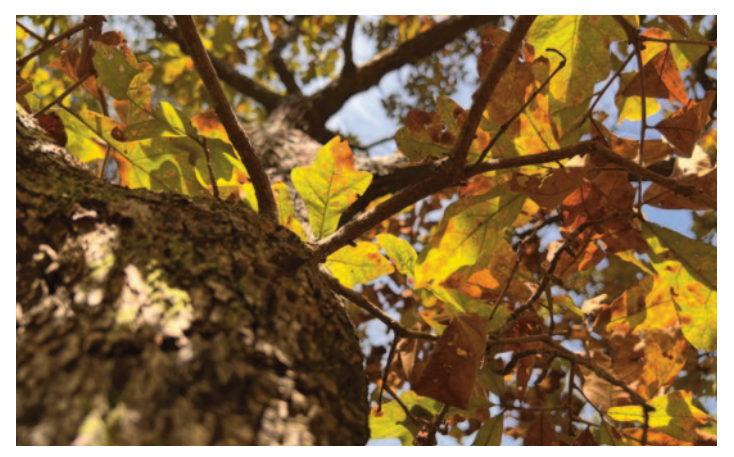
Q. boyntonii tree